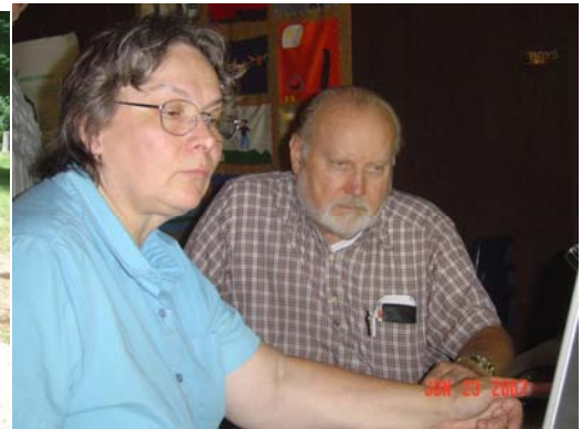
N8UZE was the GOTA control station