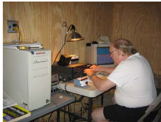
K8GT operating the 20 meter station