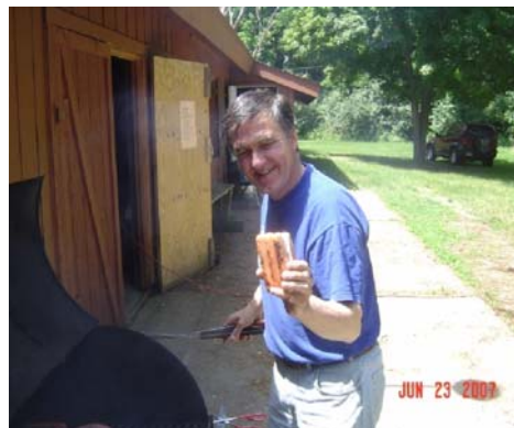
N8QVS (THE CHEF)