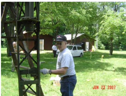
KE8UM checking out the tower