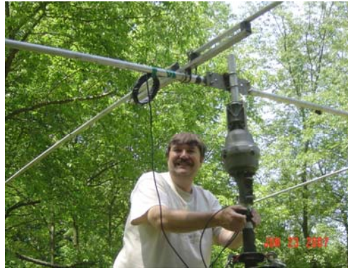
2 antennas for price of one