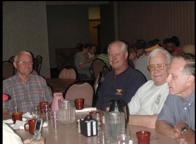
They look like they're having fun enjoying a good time at our Saturday morning Breakfast group. Come join us and see for yourself.

Ballots will be mailed about the end of September.