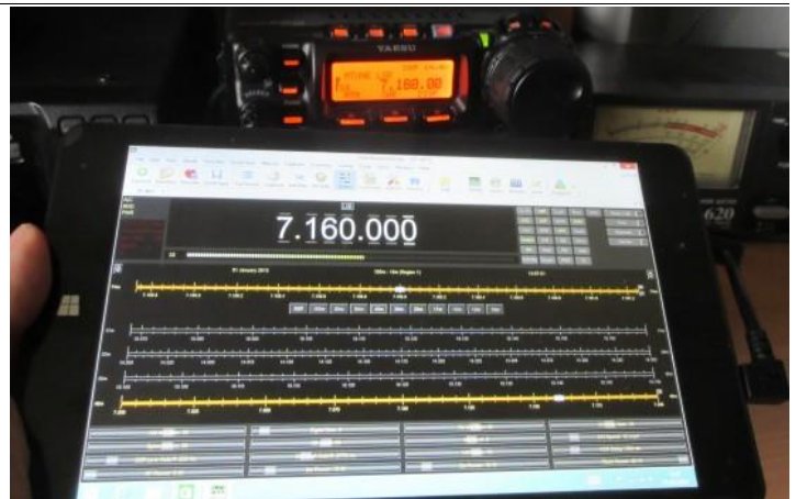
Linx tablet running Ham Radio Deluxe

On the USB point, this means CAT control/PTT either needs a Bluetooth/serial device, or some form of hardware