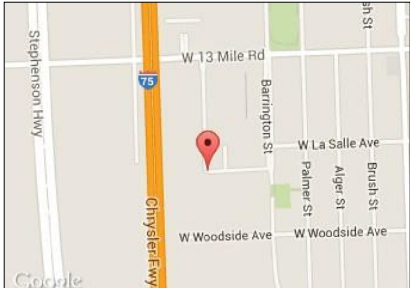
Meeting and Swap location