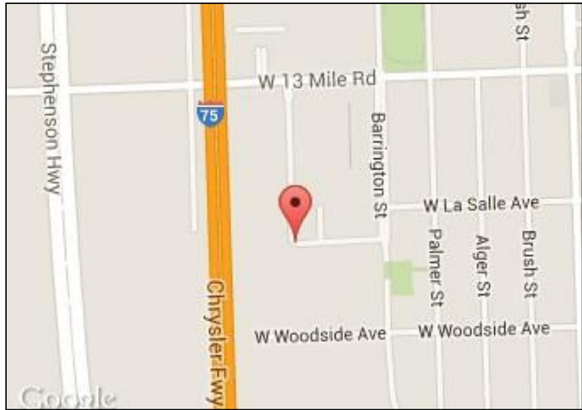
Meeting and Swap location

UFCW Hall 876 Horace Brown Dr. Madison Heights 48071