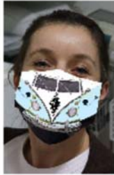
HPARC.ORG Zoom meeting Facebook live

The Hazel Park Amateur Radio Club is hosting "Field Day" An emergency preparedness & radio communications exercise. on June 27 th & 28 th , 2020