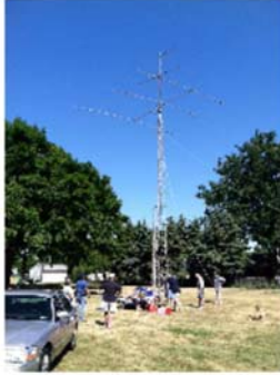
A virtual experience (due to covid19)