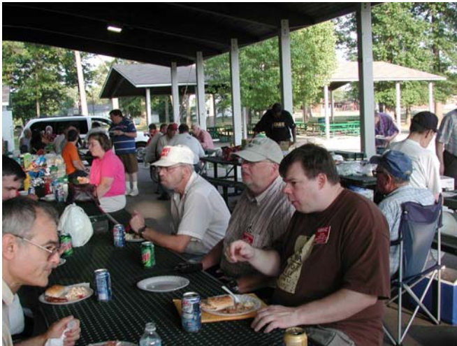
Everyone is just having fun visiting with friends