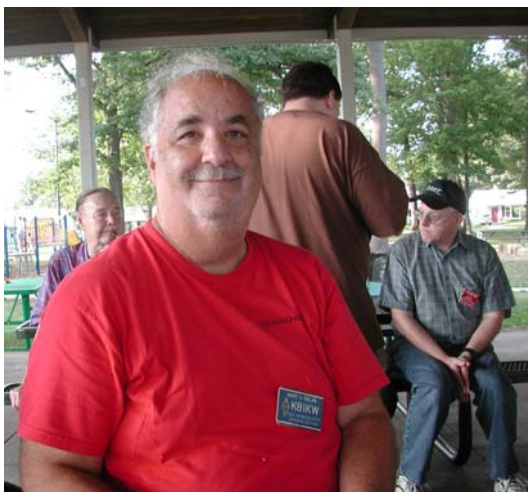
K8IKW, K8KHZ (back) and KE8UM