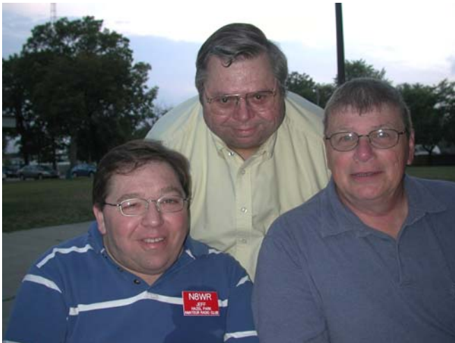
Cowardly Lion, Scarecrow, and Tin Man (AKA N8WR, K8UP, KB8ABZ)