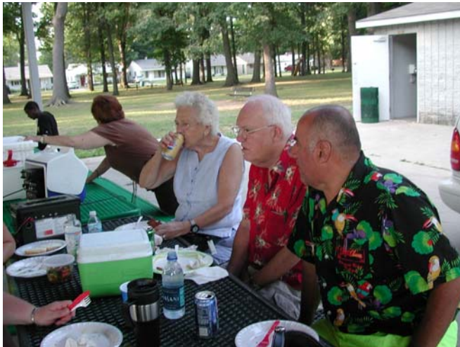
AA8OZ talking to N8UUS & XYL