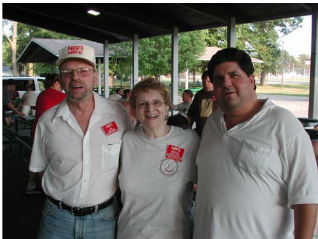
The N8F Club—N8FI, N8FE, N8FH