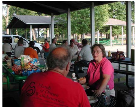
N8UZE and K8IKW (back)