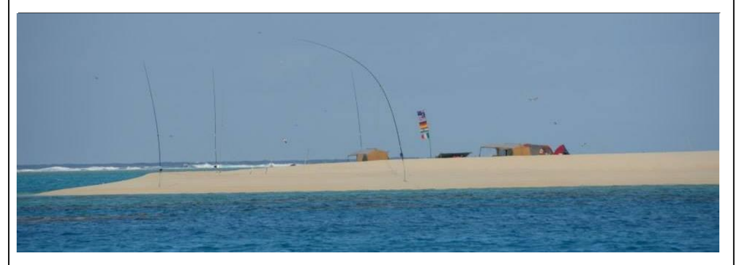
By Wes Plouff AC8JF

The VK9MTMellish Reef DXpedition might have been fairly easy to pull off. Mellish Reef is a low-lying coral reef 600 miles off Australia's northeast coast. It is the most distant of that country's Coral Sea Islands. Most of the reef is submerged, with a 14-acre island rising only ten feet above high tide at the center of a lagoon. It is also number 29 on DX Magazine 's most wanted list.