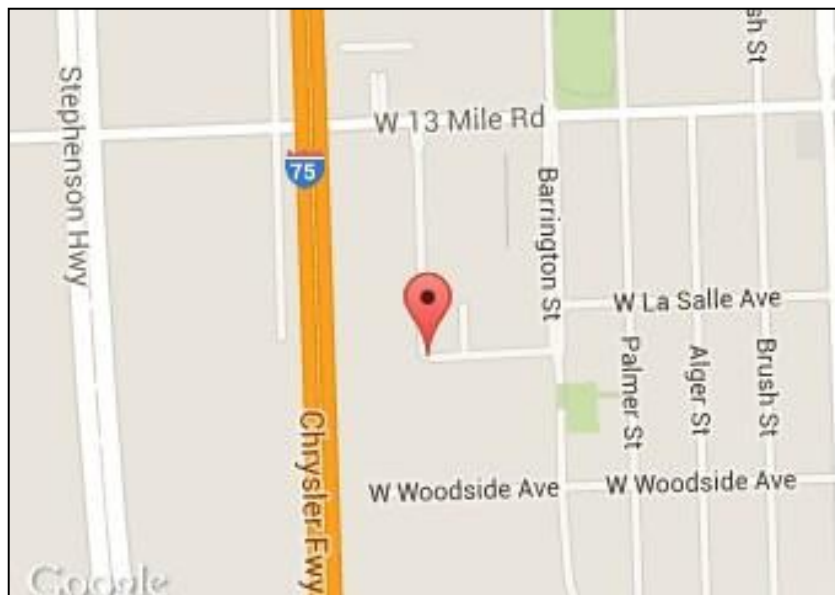
Meeting and Swap location

UFCW Hall 876 Brown Dr. Madison Heights 48071