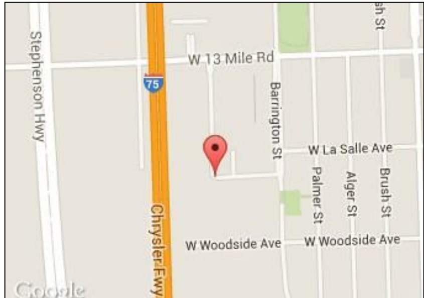
Meeting and Swap location

UFCW Hall 876 Horace Brown Dr. Madison Heights 48071