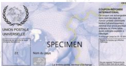
The Nairobi Model IRC will expire in 2013.