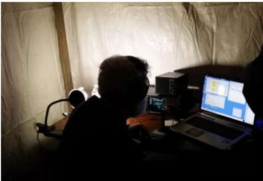
Daytime photos by Wes Plouff AC8JF