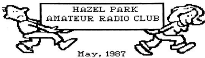
Above, 1975 ad Below, dot matrix printing! Below right, club breakfasts in 1994