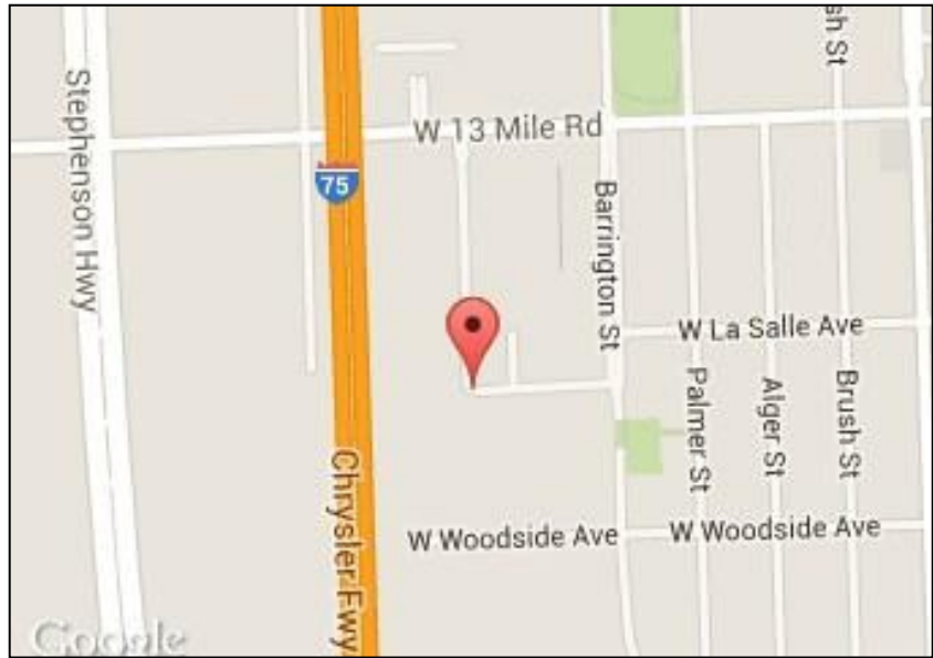
Meeting and Swap location

UFCW Hall 876 Horace Brown Dr. Madison Heights 48071