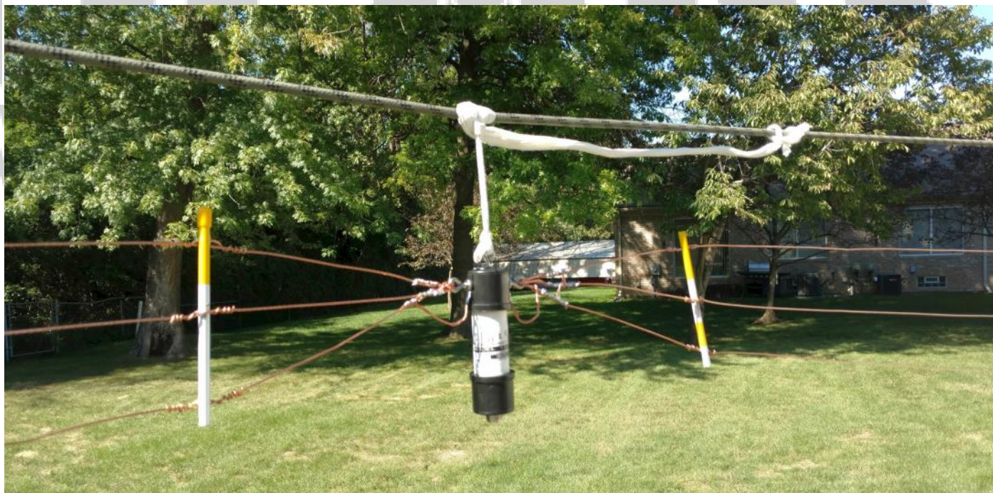
The antenna under construction.

The cord mentioned is just basic parachute cord, available from Joe's Army Navy Surplus on Woodward Ave. in Royal Oak.